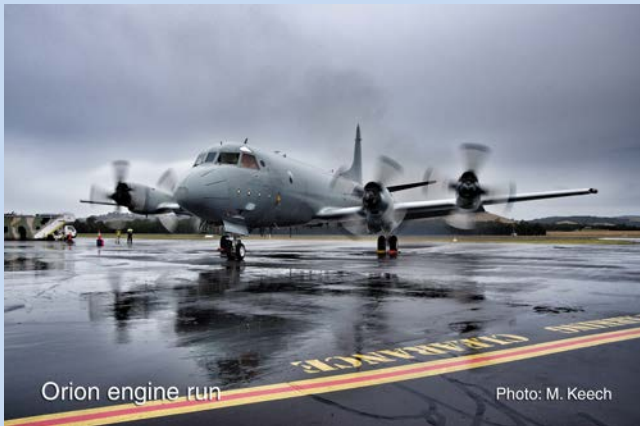
Orion engine run

Engine runs were conducted on the Lockheed AP-3C Orion as work continues to prepare the aircraft for its inclusion on the civil register.