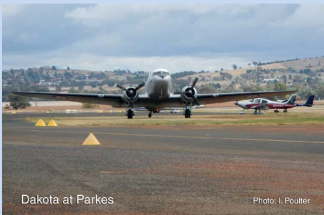
Dakota at Parkes

Celebrating the completion of recent maintenance, the de Havilland DHA-3 Drover has made numerous flights during the last months enabling crews to maintain their currency. The Douglas C-47B Dakota, A65-94, made a flight to Parkes delivering members to support the work taking place there, and Connie, our Lockheed C-121C Super Constellation made an outdoor appearance to have its engines run.