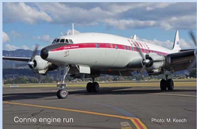
Connie engine run