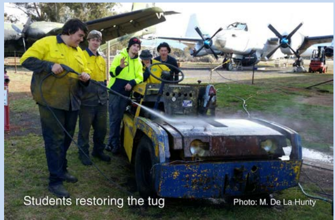
Students restoring the tug