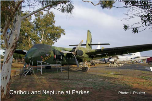
Caribou and Neptune at Parkes

A local school group has also been involved in much of the work and the students are gaining valuable experience in technical trades as well as helping HARS immensely with their efforts.