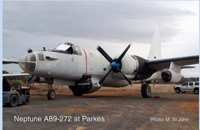
Neptune A89-272 at Parkes