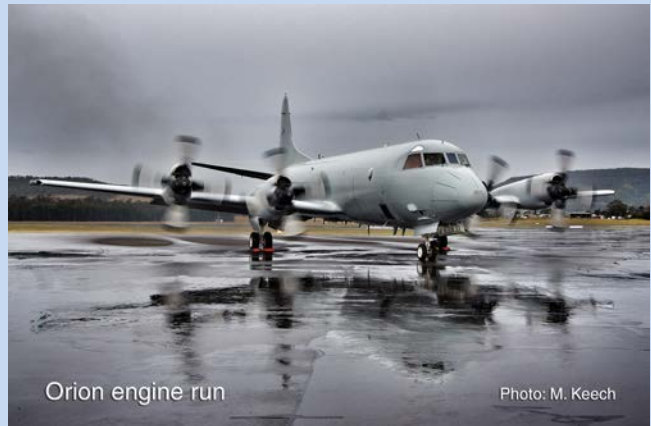
Orion engine run