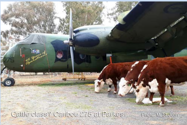
Cattle class? Caribou 275 at Parkes